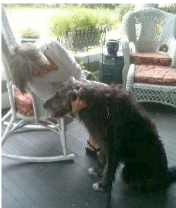
Duncan and his new mom chat on the porch.

Heidi and Lee, the two Daschunds who needed to be together, found a loving mom in October. Mom is thrilled to have them both. Mom reports that Heidi will sleep on her bed, but only after checking that Lee is alright for the evening. Lee wants to curl up with his stuffy toys in his doggie bed.