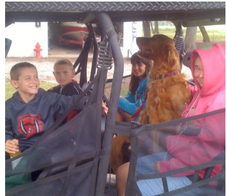
George is a happy camper. He's going to go with the kids out to check the cows on his family's ranch!

Even with the financial struggle we are having, it is our pleasure to bring to you some happy news about so many adoptions in the last few months. We were so excited to place 10-year-old Golden Retriever George with a previous Straydog adopter. George is very happy and content to have four kids to hang out with, play ball with, and go for rides with on his family's ranch! Cher also went to the same wonderful home. We have lucky dogs and lucky families!