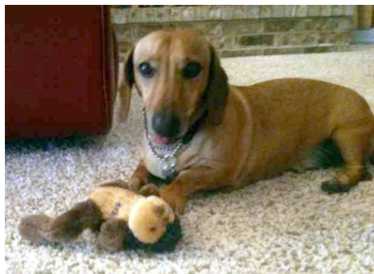
This is one of five different stuffy toys that Lee carried around during our home visit at his adoption on October 21, 2012.