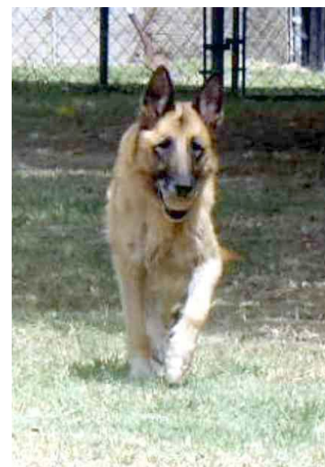
Hailey is a very sweet senior. She is gaining weight and getting healthier day-by-day at Straydog. And Hailey loves playing ball!