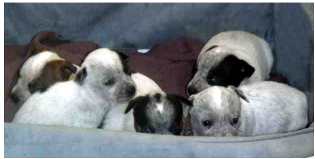
Sweet Tart's puppies all needed to go to the vet clinic along with their mother, who must have been harboring the Parvo virus from before her rescue a few weeks ago.