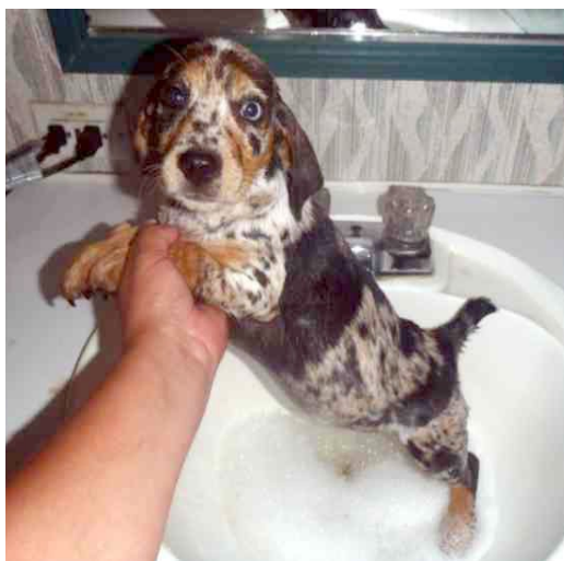
The first of Doxie's puppies is adopted today. She gets a bath before going to her new forever home!