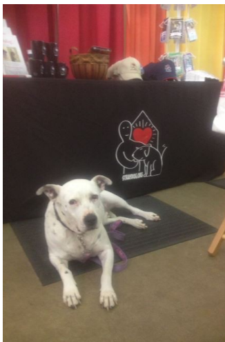
Tuffy enjoys all of his outings at our Straydog Special Event Booths.